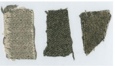
Korsy/Kersey: coarse, thick, and sturdy woolen cloth