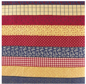
Calico: cotton fabric