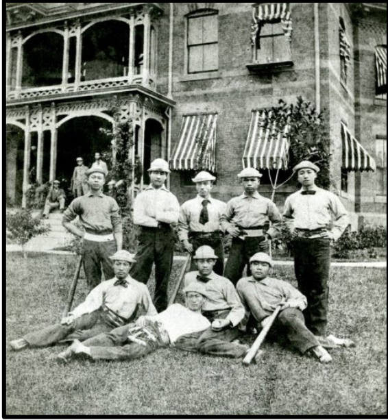
Chinese Educational Mission baseball team

The Chinese government worried that Wing's students were becoming too "American." Then, in 1882, the United States passed a law called the Chinese Exclusion Act to keep Chinese people from immigrating (moving permanently) to the United States or becoming citizens. Wing had to close his school. The United States government said he could not be a citizen anymore. He was forced to leave the country and his family, although he returned in 1902 to see his son graduate from Yale. Wing then stayed in the