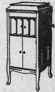
Columbia Grafonola Price $85