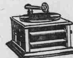
Columbia Grafonola Price $18